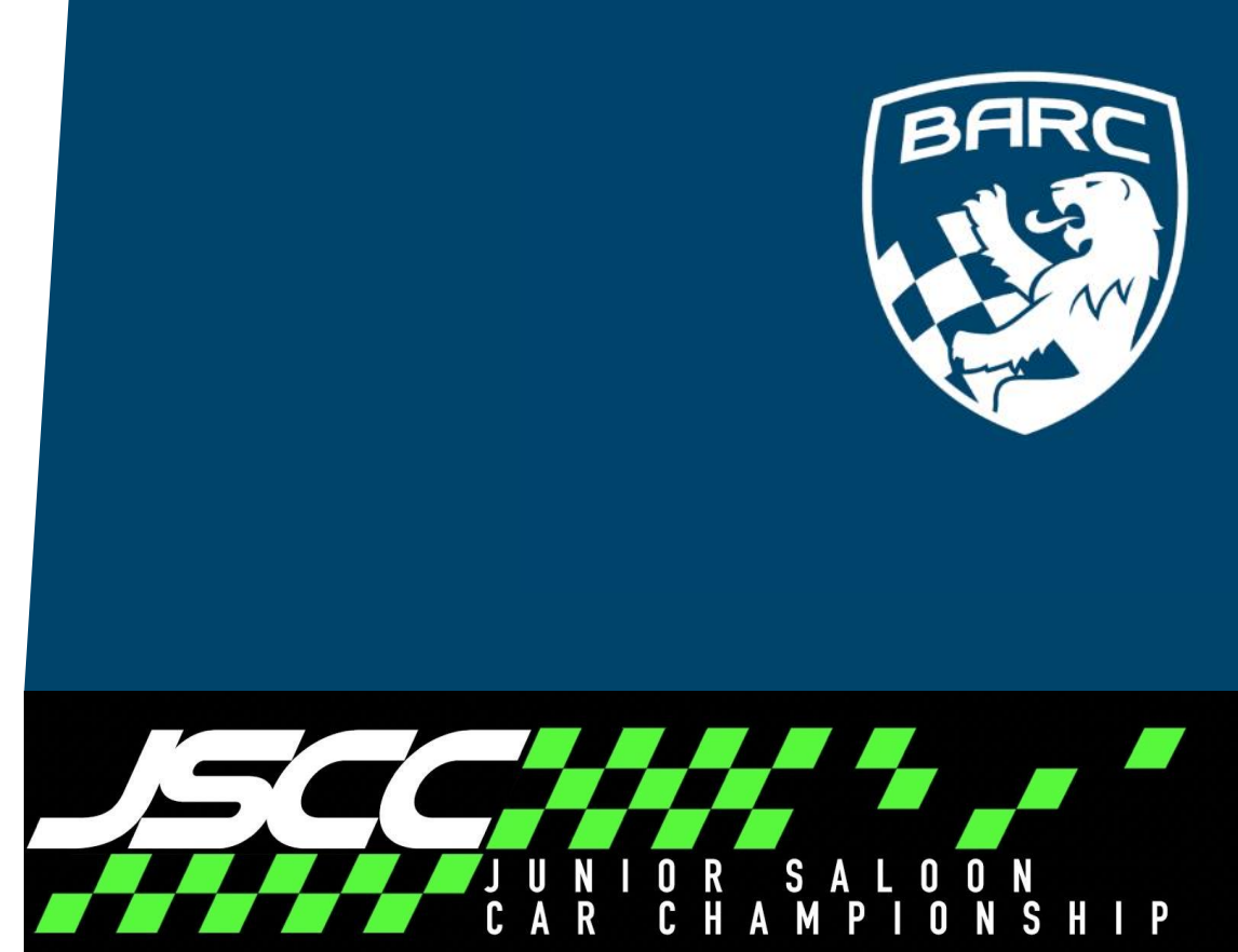
2025 Junior Saloon Car Championship