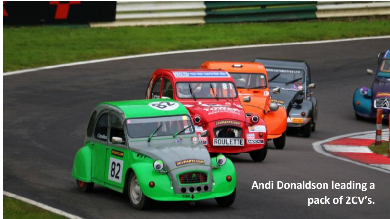
Andi Donaldson leading a pack of 2CV's.

The iconic Citroen 2CV, with some modifications for safety and performance, makes an unlikely but successful racing vehicle – nearly entirely indestructible, it is easily repaired as Citroen designed, and showcases the skill of drivers who understand how to make the most of a car with limited top speed to maintain momentum and take the car to its limit.