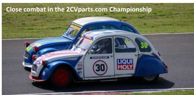
Close combat in the 2CVparts.com Championship

The main Autos de France course is a serving of L'Escargot. Proving that you don't have to be fast to be competitive and exciting. The 2CVparts.com Championship for the timeless classic Deux Chevaux has been running for over 30 years with undiminished enthusiasm and never disappoints when it comes to action on (and sometimes off) the track. You can catch them in races 4 & 10.