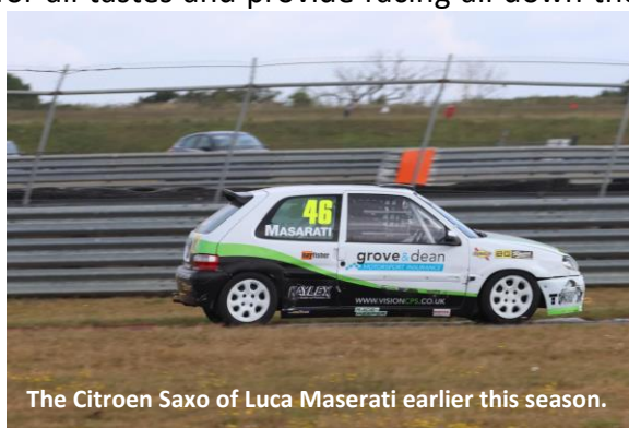
The Citroen Saxo of Luca Maserati earlier this season.

Race 2 is our first all French dish, with the Citroen Saxos of the Junior Saloon Car Championship. Guaranteed action from lights to flag as the 14 to 17 year old drivers in identical machines fight for the same bit of tarmac. You can also catch them in race 9.