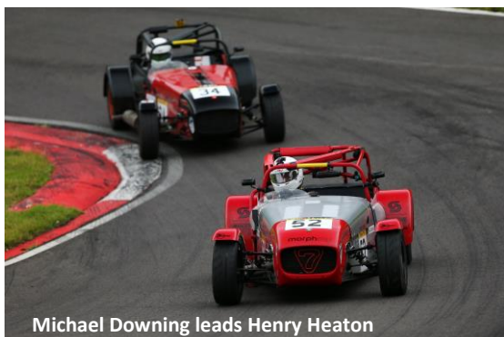
Michael Downing leads Henry Heaton

Sigma 150 - Based on the Caterham Motorsport 310R specification with the 1600cc Ford Sigma TiVCT engine (approx. 150 bhp) with limited slip differential and wide track suspension. Tyres are Toyo 185/60 R13 R888R. From this season onwards this also includes the cars that previously raced as the Sigmax class (Ford Sigma 'fixed cam' engines making approx. 140 bhp)