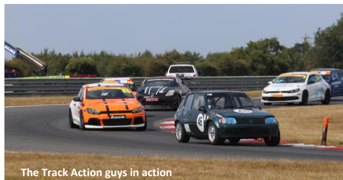
The Track Action guys in action

The competitors in Race 2 (Sat), 7 & 13 (Sun) will mostly be back at school and finding time between their homework to race in the Junior Saloon Car Championship. Open to 14 to 17 year olds driving identical Citroen Saxos it is a well established stepping stone to more grown up things. Talking of more grown up things (we don’t just throw this together you know). The BARC (NW Centre) CNC Heads Sports Saloon Championship is 40 years old and still going strong. You can see it’s mixture of almost standard, highly modified and every type of machinery in-between